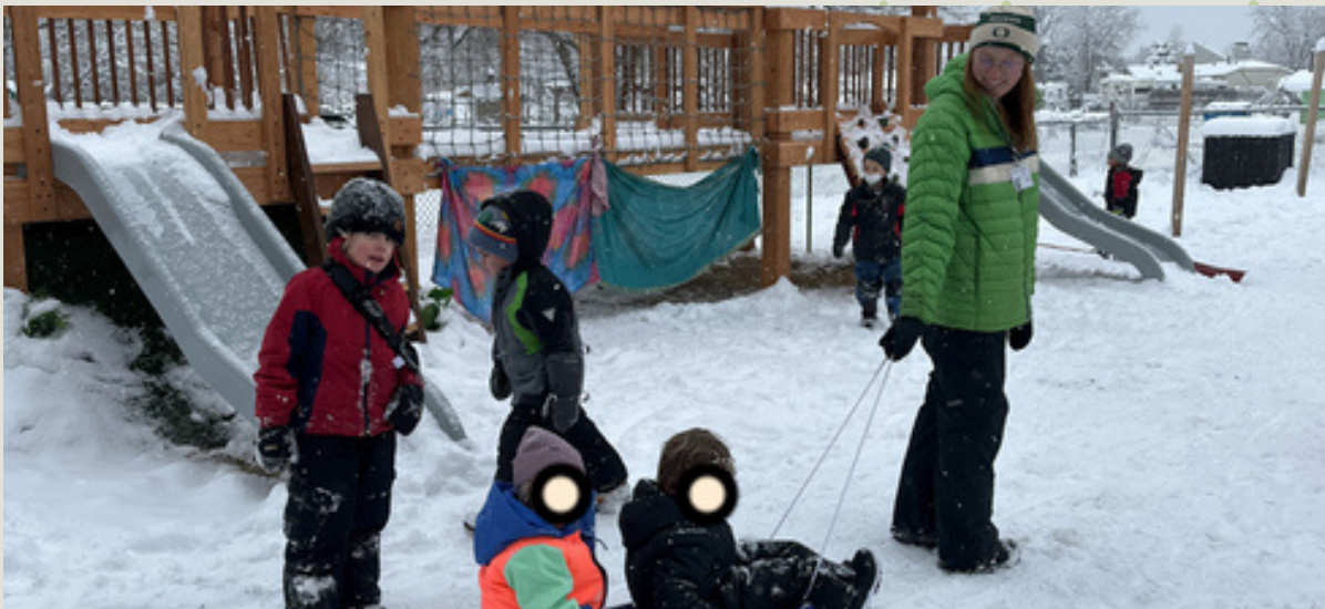
Winter play at Cottonwood Cottage