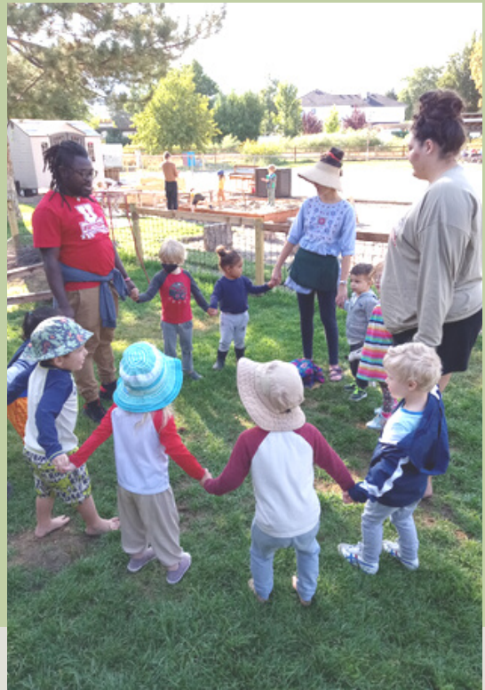
Circle Time in the Movement Meadow

Mission: Increasing child access, educator implementation, research enrichment, and advocacy engagement for nature based early childhood education.