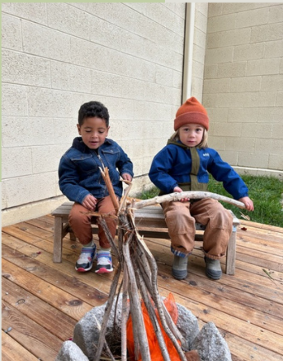
Pretend Play in the Theater