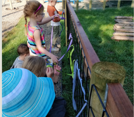
Fence weaving at the Movement Meadow